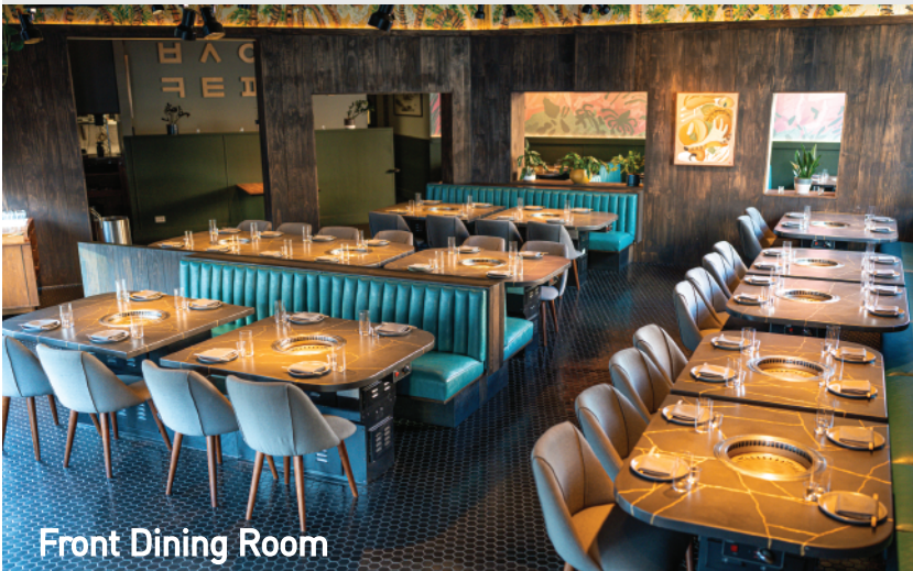
Front Dining Room

For large gatherings and events, we can offer our parlor space or our front dining room.